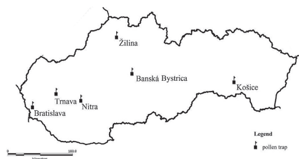
Figure 1. Locations of pollen monitoring stations in Slovakia.

Pollen sampling was performed using a Hirst-type 7-day volumetric pollen trap (Burkard Manufacturing Co Ltd.). The methodology used was performed according to the standard method adopted by the British Aerobiology Federation [10]. Betula pollen grains were counted in 4 longitudinal traverses (except for Bratislava, where 12 transversal traverses were