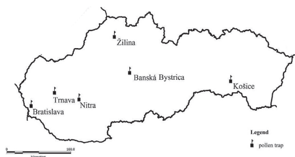
Figure 1. Locations of pollen monitoring stations in Slovakia.

Pollen sampling was performed using a Hirst-type 7-day volumetric pollen trap (Burkard Manufacturing Co Ltd.). The methodology used was performed according to the standard method adopted by the British Aerobiology Federation [10]. Betula pollen grains were counted in 4 longitudinal traverses (except for Bratislava, where 12 transversal traverses were